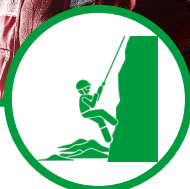
Rescue at Heights