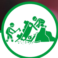
Technical + Urban Search & Rescue